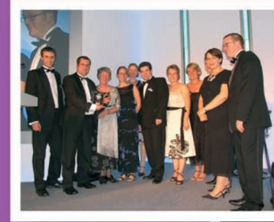
Feldon Veterinary Centre Practice of the Year 2007